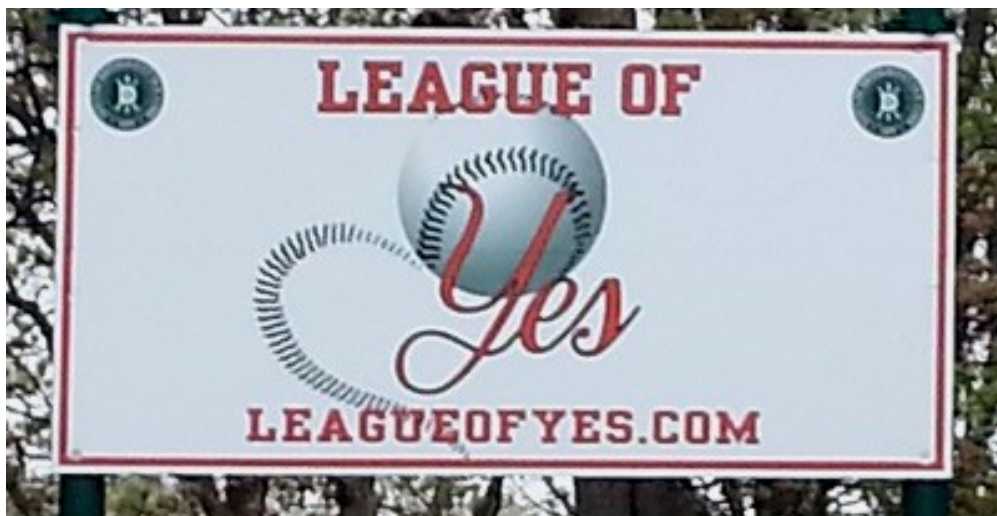
The new League of YES sign at the Farmingville, New York baseball field.

Check the website www.leagueofyes.com for more information about the League of YES and photos of the construction progress.